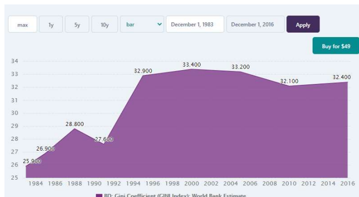
Figure-1: Bangladesh Gini Coefficient: World Bank estimate from 1983 to 2016 in the chart

In the trickle-down process, quality of growth is an important issue—especially in the process of resource flow from rich to poor or poor to rich. In social science researches measuring quality is a difficult task. This is difficult when measuring/ranking the quality of people's happiness with Gini Index, growth, or Human Development Index (HDI). Bangladesh placed 125 among 156 countries in the World Happiness Report (WHR). This is regarded as a new economic paradigm to evaluate the economic growth process and its impact on the dimensions that support well-being including basic human needs and rights (Helliwell, Layard, & Sachs, 2019). The Gini index is a statistical measure. It, usually, is used widely in analyzing income inequality. There exists a set of values to measure the degree of variation in various income groups. It is a scale of distribution of nations' income and wealth. On this scale, "0" represents complete equality while "100" represents complete inequality. Income or wealth inequality harms people's life: it incurs a loss in human development. The World Bank observed data for a total of nine times from 1983 to 2016 of Bangladesh. The estimated data on the Gini coefficient reached a high of 33.40% in 2000 while a record low of 25.90% in 1983 while it is 32.40% in 2016.